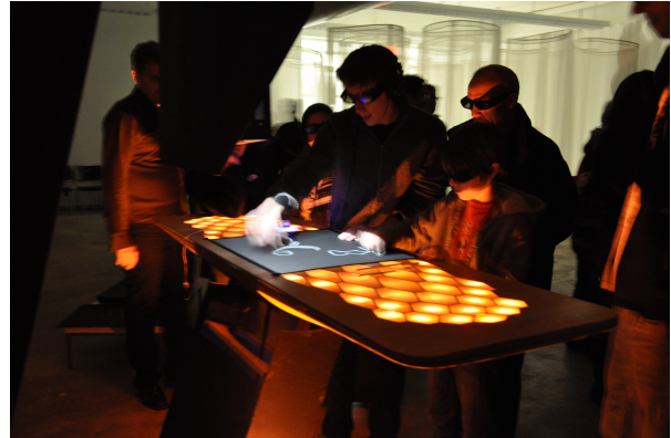
Figure 1: An individual interacting with Drawn Together as others observe

This work was supported by NSF Grant #0905516, Georgia Tech College of Architecture, School of Architecture, School of Industrial Design, School of Interactive Computing, and the Center for Music Technology